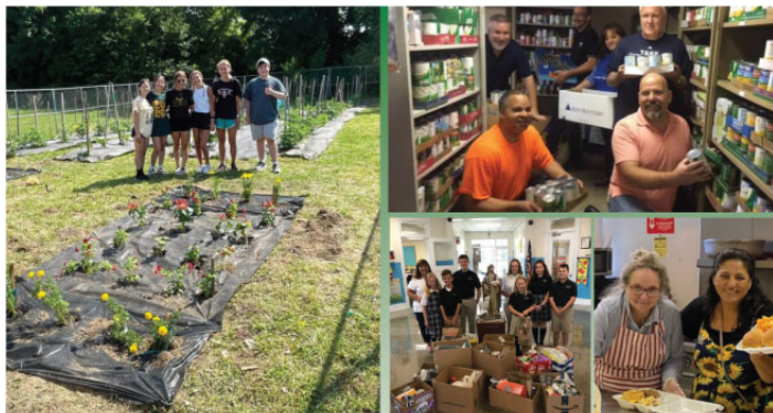
Featured projects: Allentown Central Catholic High School Central City Project, Whitehall/Coplay Hunger Initiative, & Catholic Charities Food Pantry

THE POVERTY RELIEF FUND COLLECTION will be taken up this weekend, Nov 19/20. Your generosity helps those who are in need locally in the Diocese of Allentown. The 2021 Poverty Relief Collection funded 24 projects across the five counties.