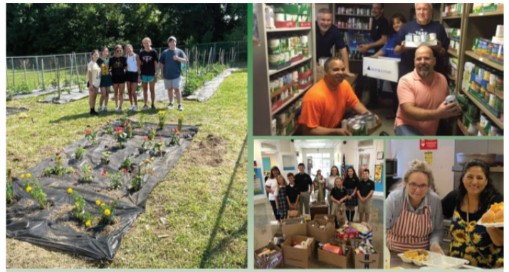
Featured projects: Allentown Central Catholic High School Central City Project, Whitehall/Coplay Hunger Initiative, & Catholic Charities Food Pantry